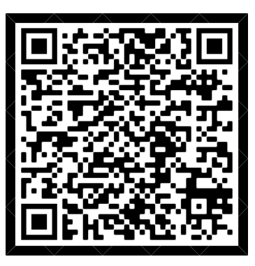
Click or Scan on the QR code for more details

WHEN WILL A STAY-HOME NOTICE BE ISSUED, AND WHAT DOES IT MEAN TO US IF WE GET ONE?